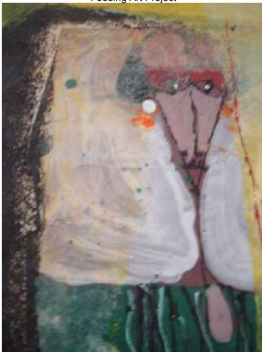
Artwork (detail) by Kre MBaye