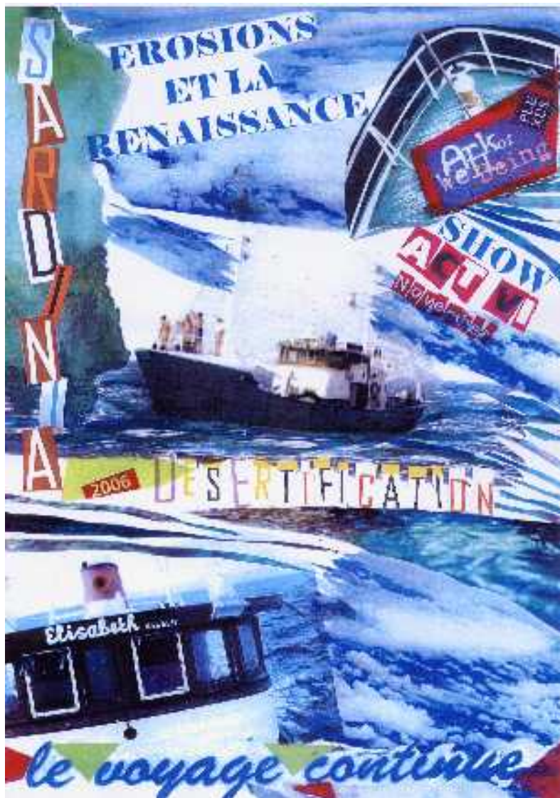
Poster by Luisa Mazzullo, Rome 2006