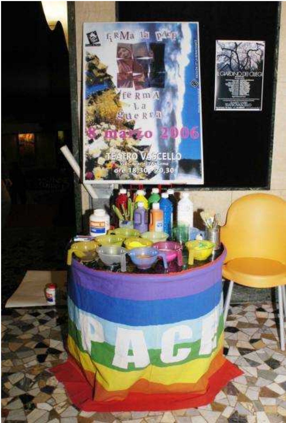
Poster by Luisa Mazzullo, installation by Micaela Serino, Teatro Vascello, Rome 2006