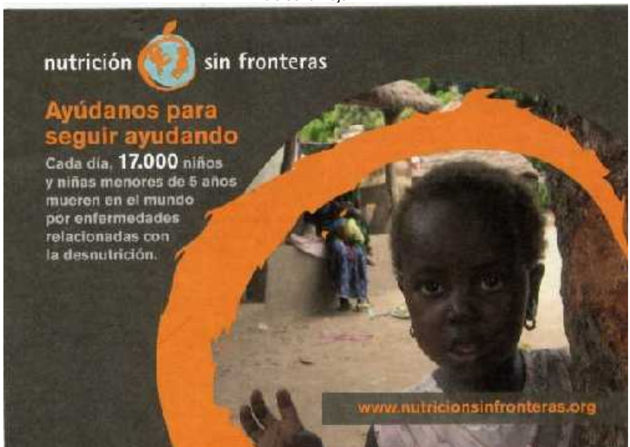
Nutrition without Borders, Las Palmas de Gran Canaria 2006