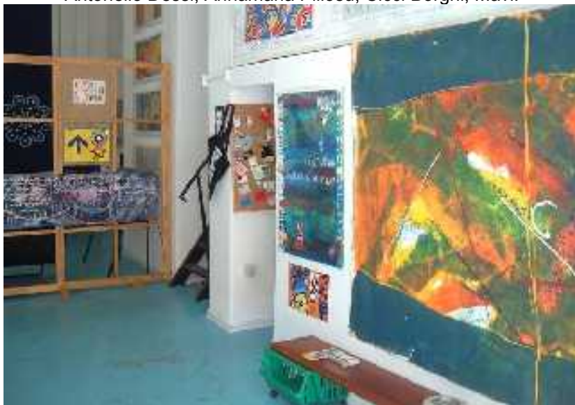
Pietro Zambelli Garage, Cagliari 2006