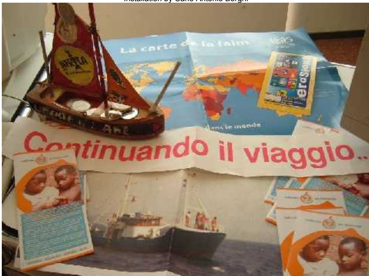
Mediterranean Diet International Congress, Barcelona 2006