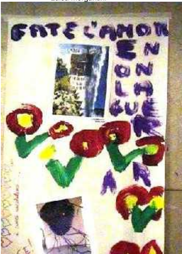
Teatro Vascello, Rome 2006