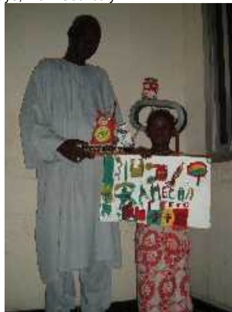
Municipality of Medina, Dakar 2006