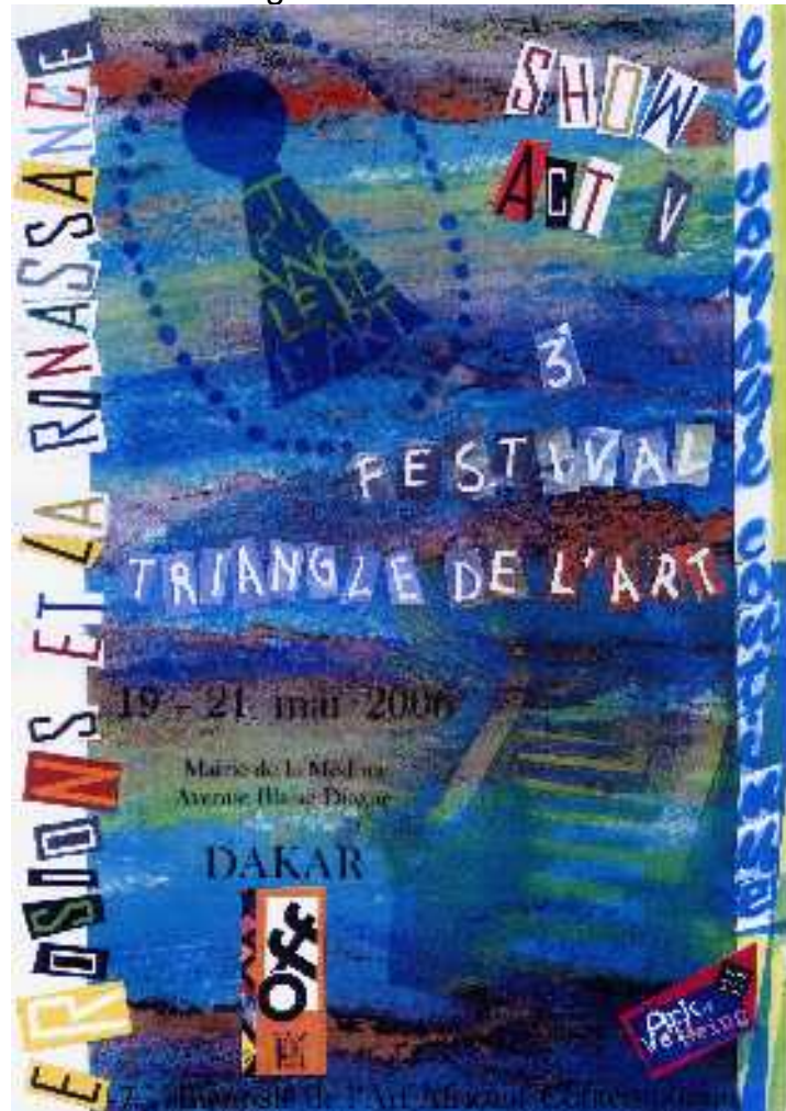
Poster by Luisa Mazzullo, Rome 2006