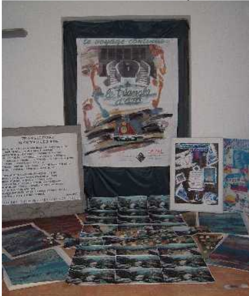
Installation by Luisa Mazzullo