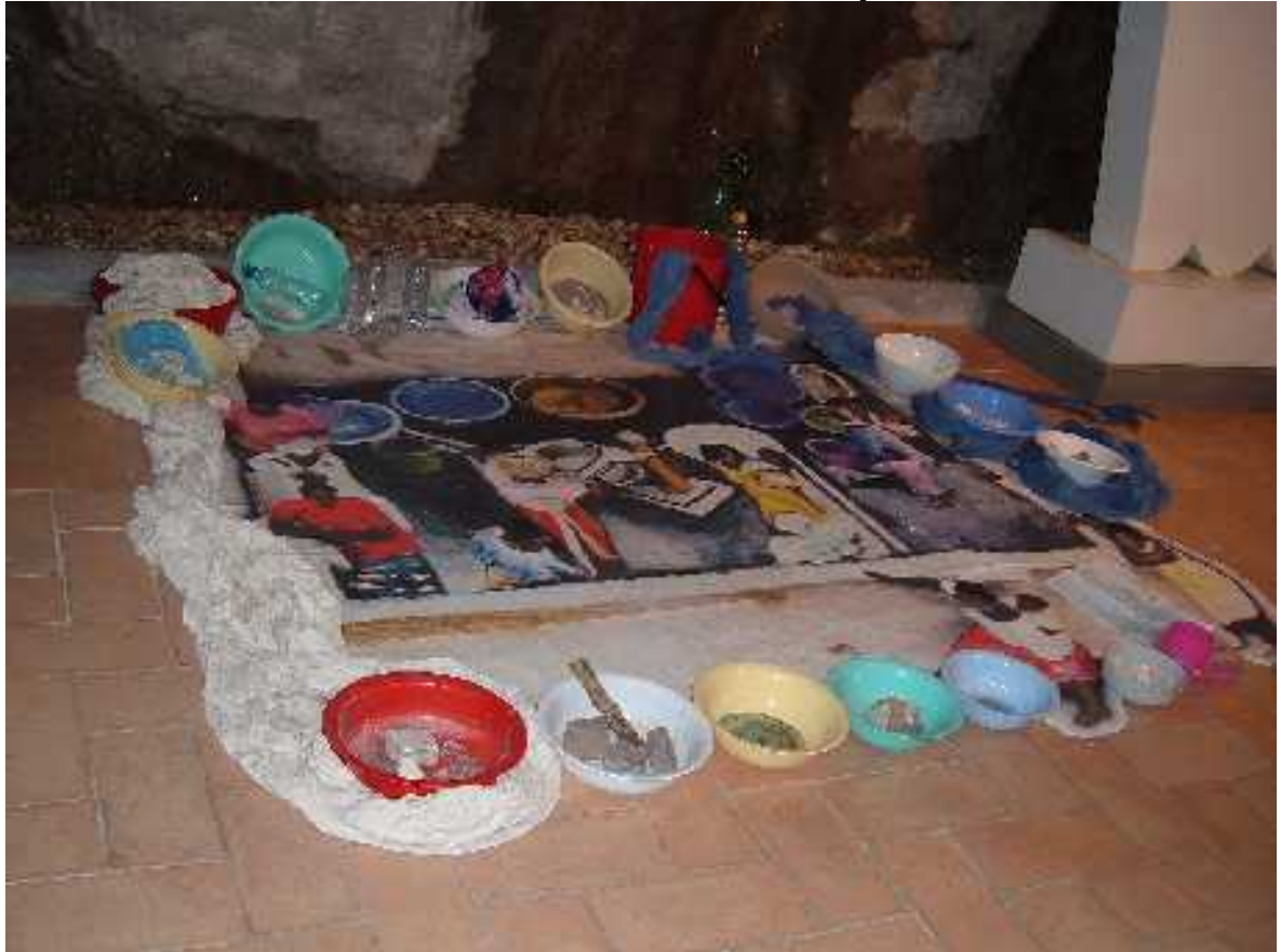
Installation by Micaela Serino